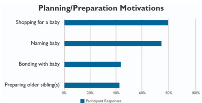
Figure 2: Planning/Preparation Motivations Behind Early Fetal Sex Determination.

The next portion of the survey detailed potential planning and preparation factors that may have influenced expecting mother’s decision to learn the fetus’s sex at the earliest opportunity (Figure 2).