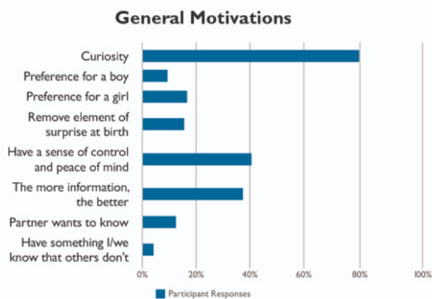
Figure 1: General Motivations Behind Early Fetal Sex Determination.

The survey began with potential general motivations that compelled expecting mothers to seek knowledge of their fetus’s sex (Figure 1).